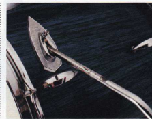
■ BASS DRUM SPURS Telstar conical bass drums required elongated 12 1/4" spurs with the type 'C' ship-form mounting bracket.