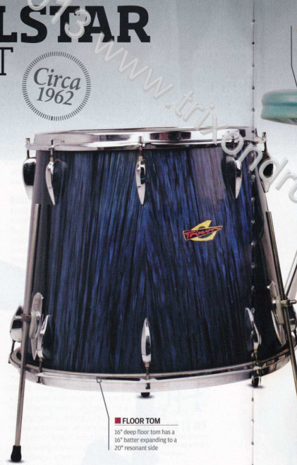
■ FLOOR TOM 16" deep floor tom has a 16" batter expanding to a 20" resonant side