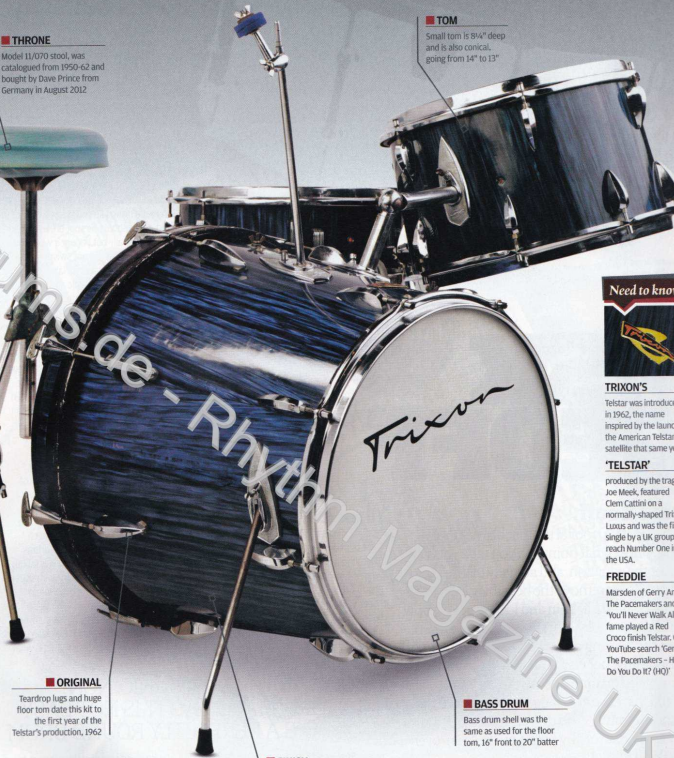
■ TOM Small tom is 8 1/4" deep and is also conical, going from 14" to 13"