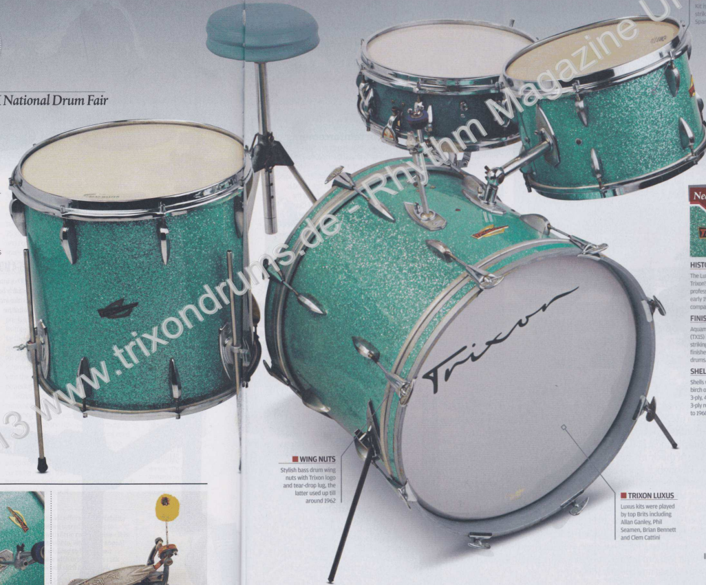
FINISH Kit is finished in striking Aquamarine Sparkle wrap