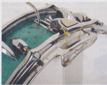
THROW-OFF Snare has parallel action throw-off and even the snare guard on the bottom hoop has the Trixon logo.