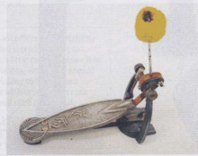
BASS DRUM PEDAL Original 172 bass drum pedal, made between 1950 and 1956. Has twin springs and leather drive strap.